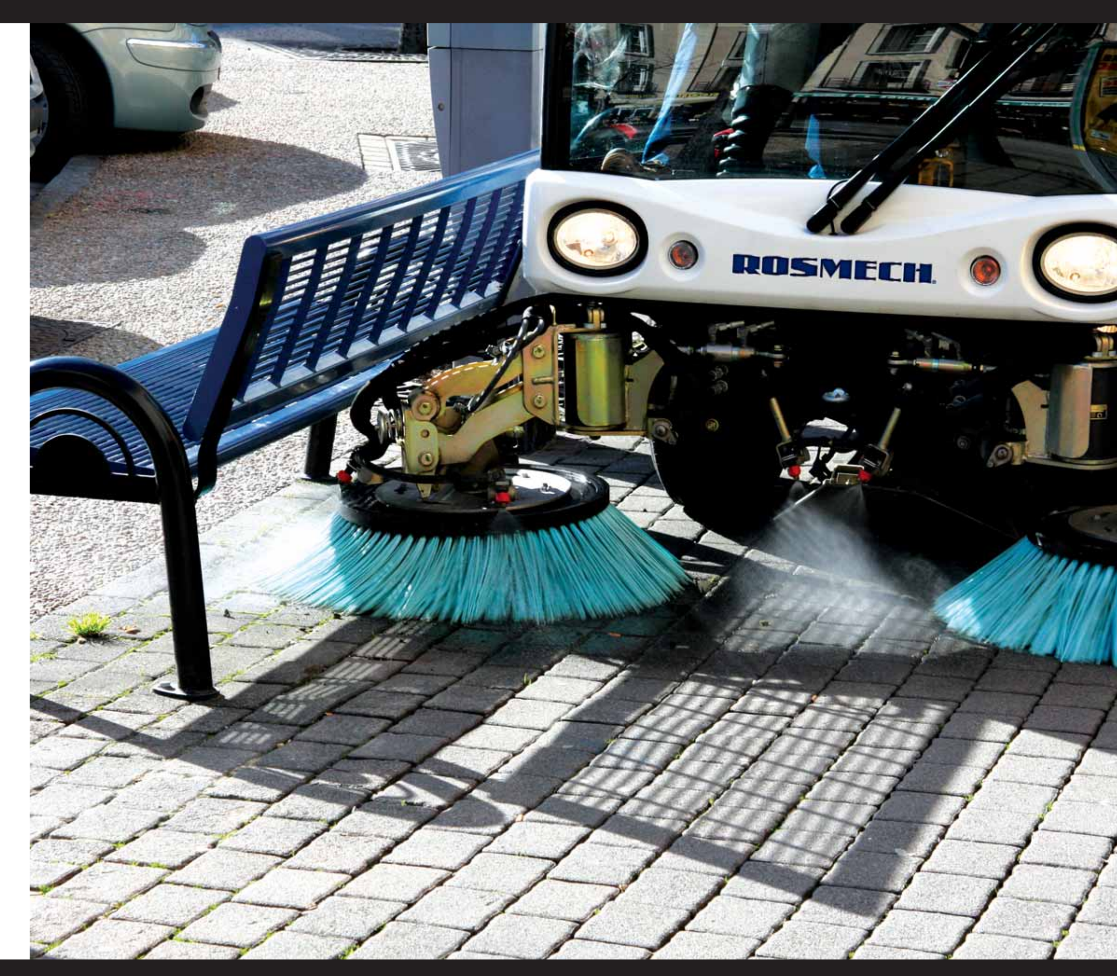
IMAGE: The Azura MC 200 demonstrating manoeuvrability around fixed seating.