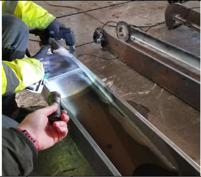
BOBİN TONGU BAĞLANTI KOLU DETAY-1 / 0586.00.0700