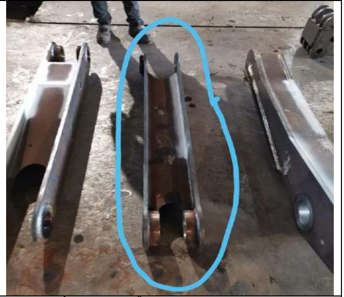
BOBİN TONGU BAĞLANTI DETAY-2 / 0586.00.0700