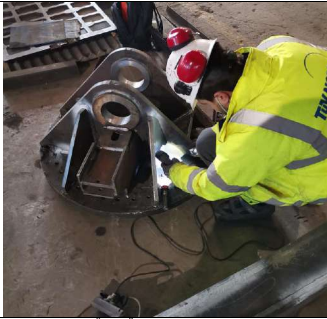
ÜST GÖVDE - 0586.00.0100