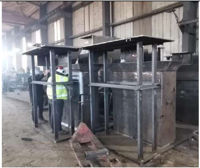
BOBİN KISKACI SEHPASI - 0586.00.1100