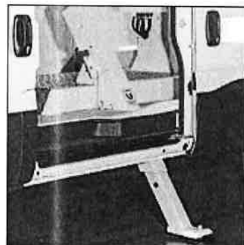
Proven A-frame stabiliser system