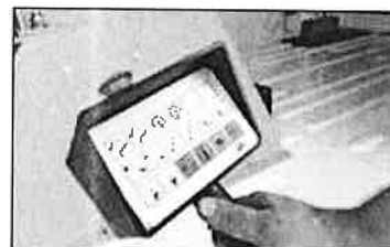
12V DC emergency ground controls