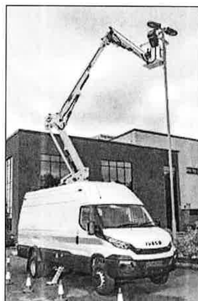
Articulated, telescopic boom maximises the working envelope of the platform