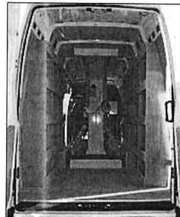
Massive storage and load capacity